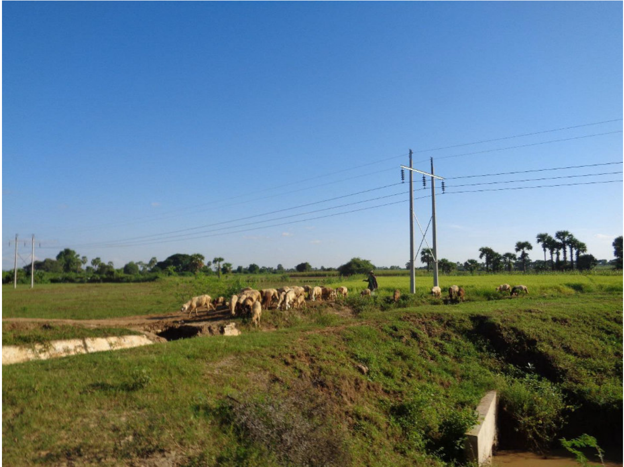
Photo No. 32. Villagers along the water supply pipeline route where farming and pasturing are the common means of livelihood.