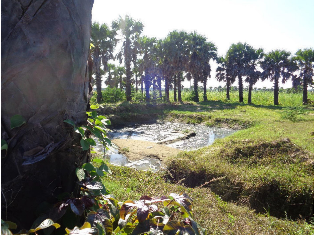
Photo No. 21. Domestic (sanitary) wastewater discharges into the adjoining farm land from the Min Dhama workers' accommodation camp. This was addressed and corrected by the Project immediately after this was noted during the inspection.