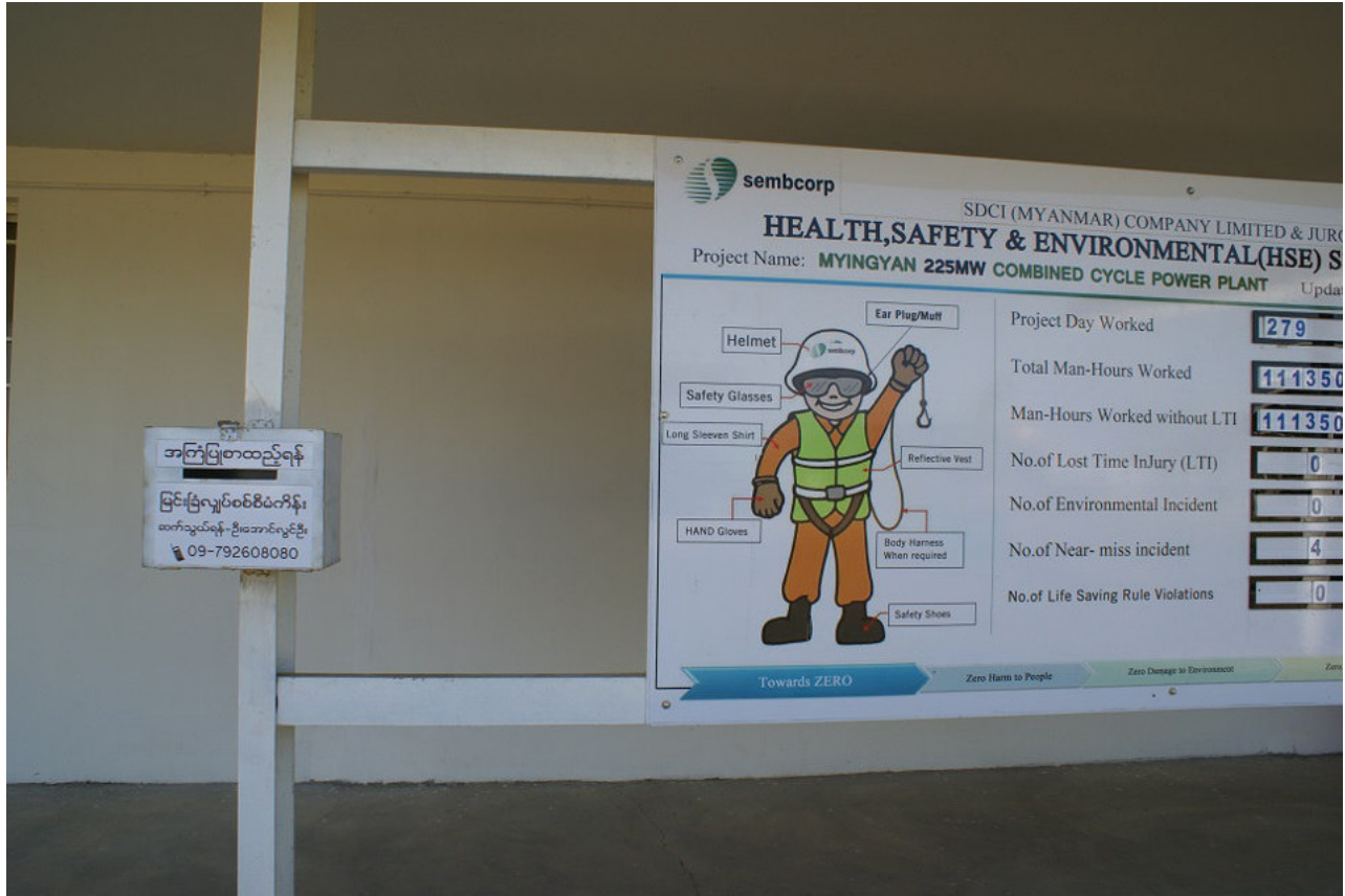
Photo No. 2. Grievance Mechanism suggestion box in front of the Semcorp office at the Project site