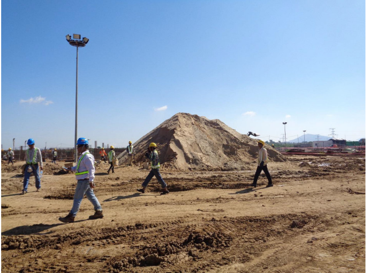
Photo No. 11. At the Project construction site, everyone is wearing proper PPE