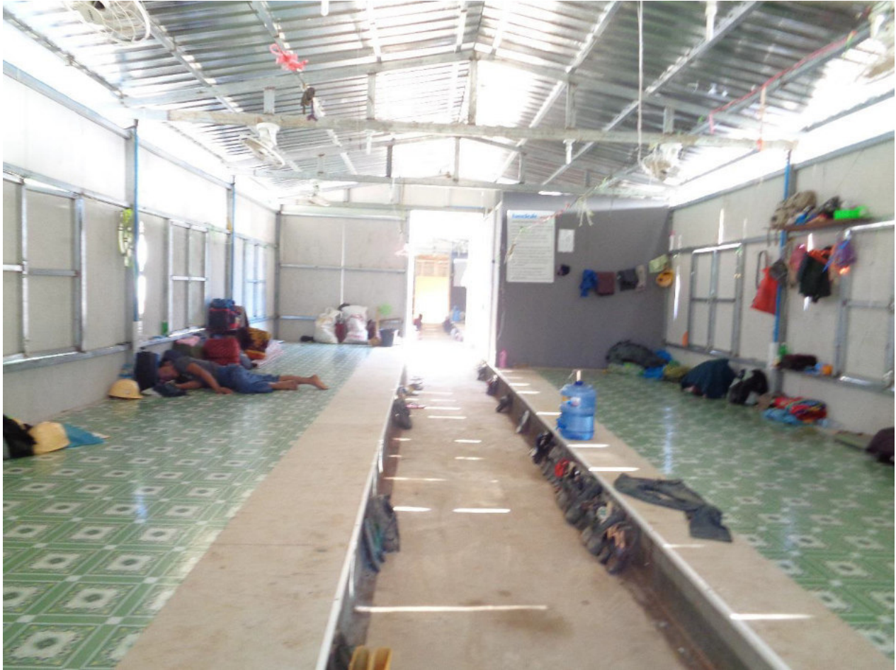
Photo No. 24. Sleeping area at the Bedok workers' accommodation camp, which is not in compliance with Lenders' standards.