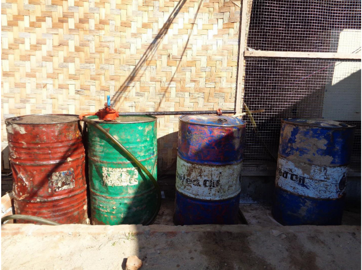
Photo No. 22. Fuel storage for the genset at the Min Dhama workers' accommodation camp. Needs improvement on the containment in case of leak or spills.