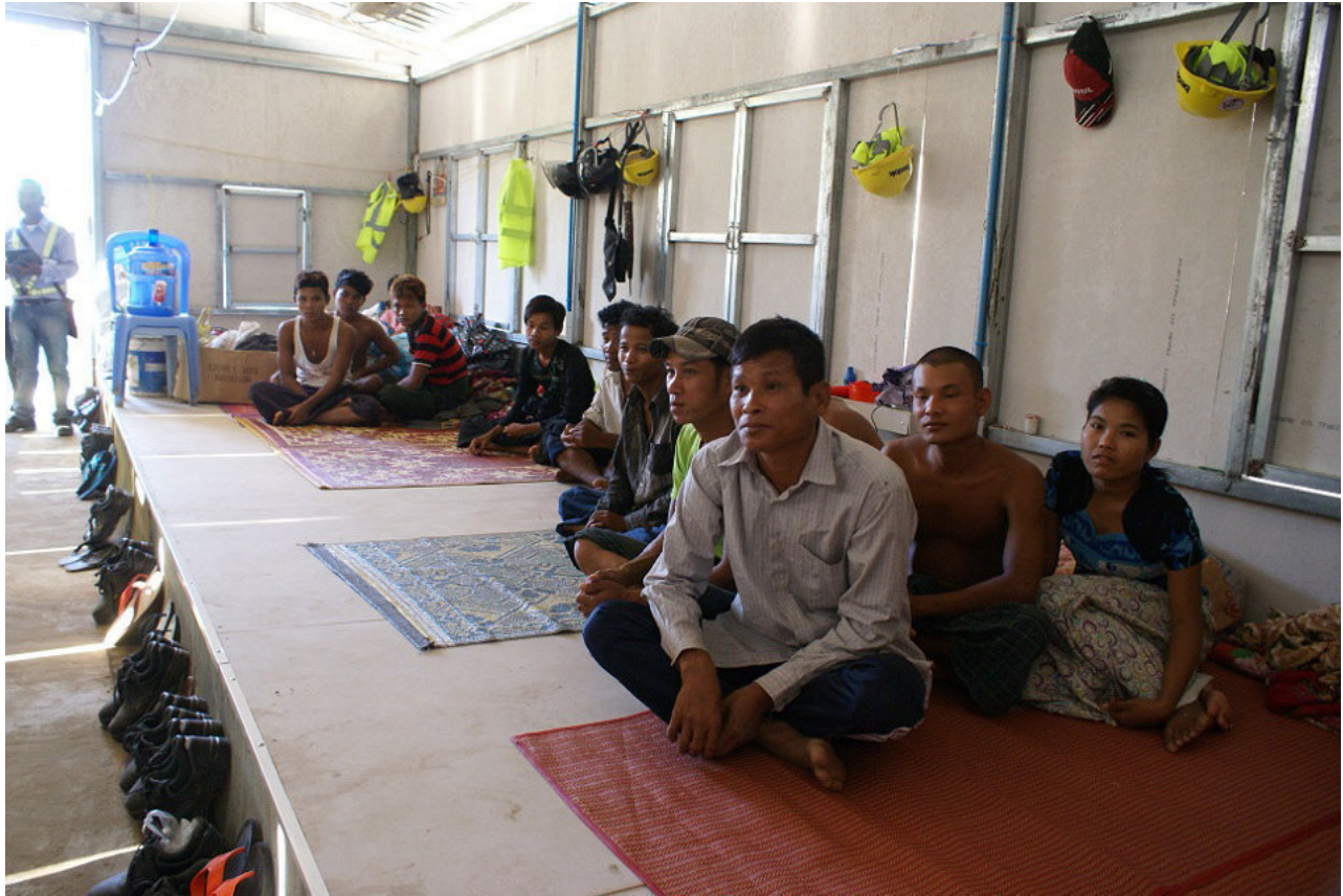
Photo No. 25. Workers relaxing and watching TV in a sleeping area at the Bedok workers' accommodation camp.