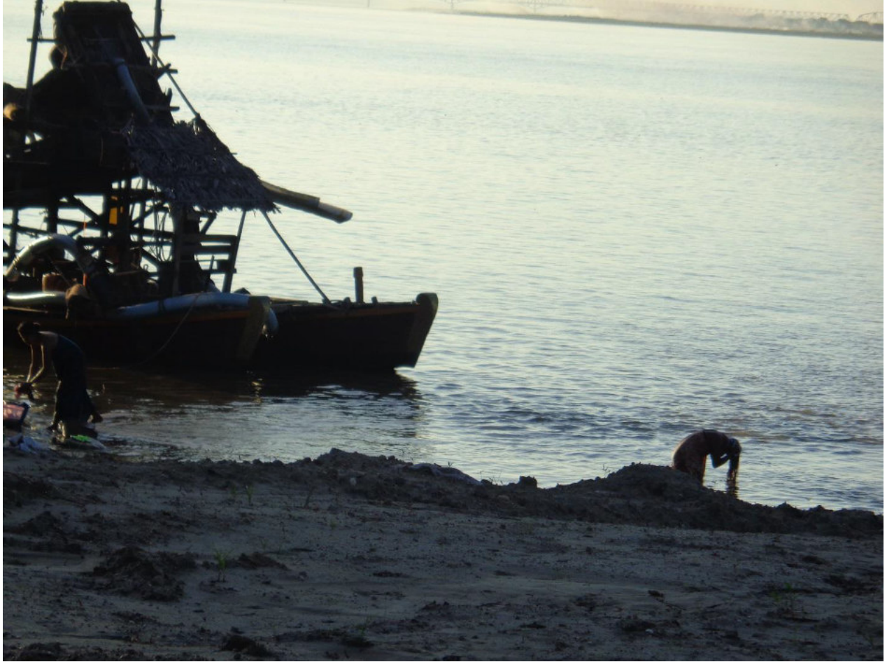
Photo No. 31. Other users of the jetty when not in use by the Project or the jetty owner.