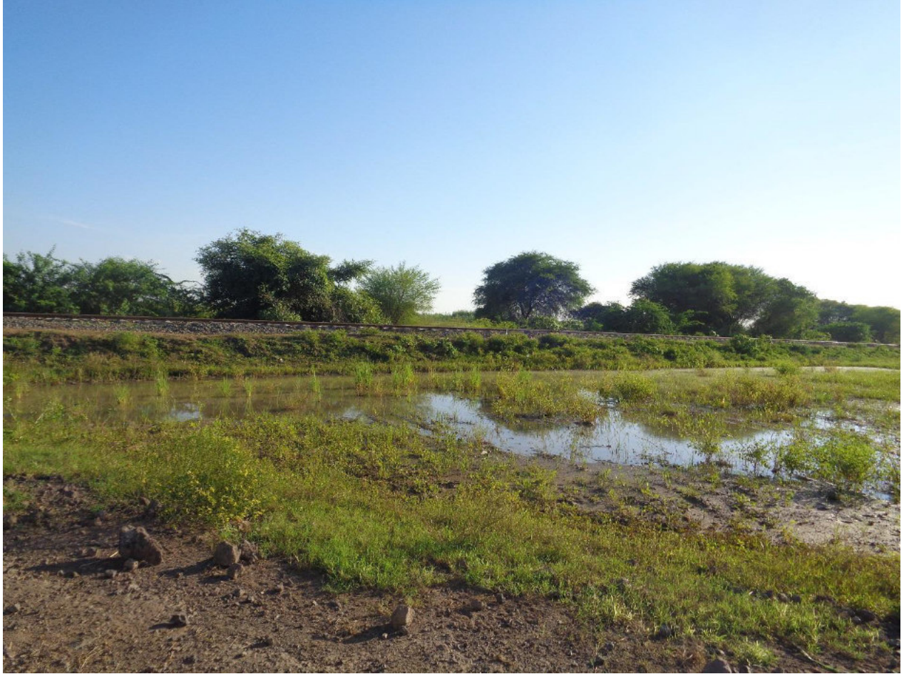
Photo No. 33. Along the access road to the Project site from the area where the water supply pipeline will be installed. Migratory birds and resident birds drink and feed in this area away from the village.