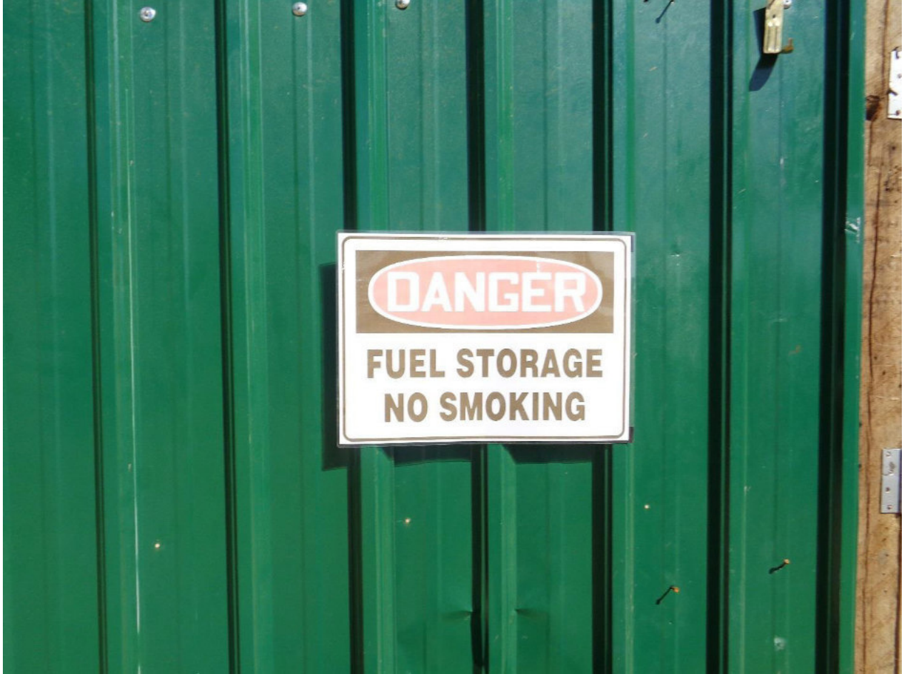
Photo No. 6. Sign at the fuel storage, as part of safety reminder, at the Project site