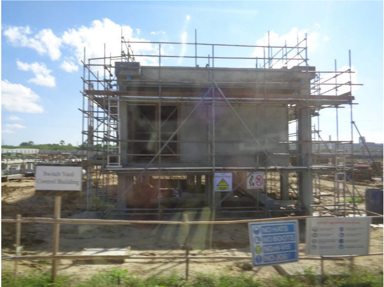
Photo No. 7. Strict reminder to wear PPE at the construction areas within the Project site