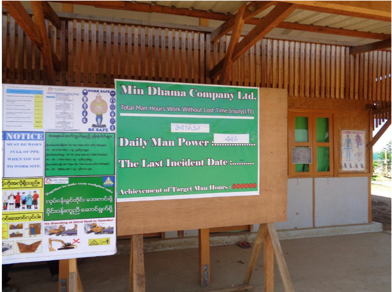
Photo No. 9. Daily log of Min Dhama Health & Safety incidents (zero to date) at the Project site.