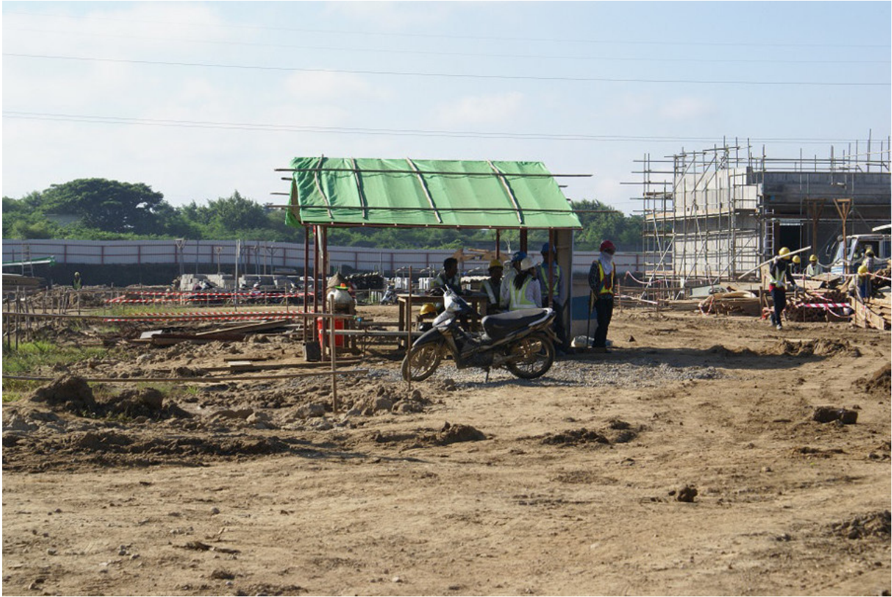
Photo No. 14. Another workers rest area at the Project construction site