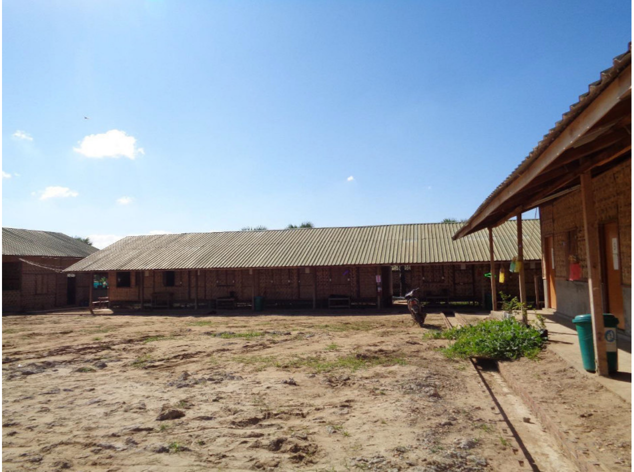
Photo No. 15. Workers accommodation camp for Min Dhamma workers (and families)