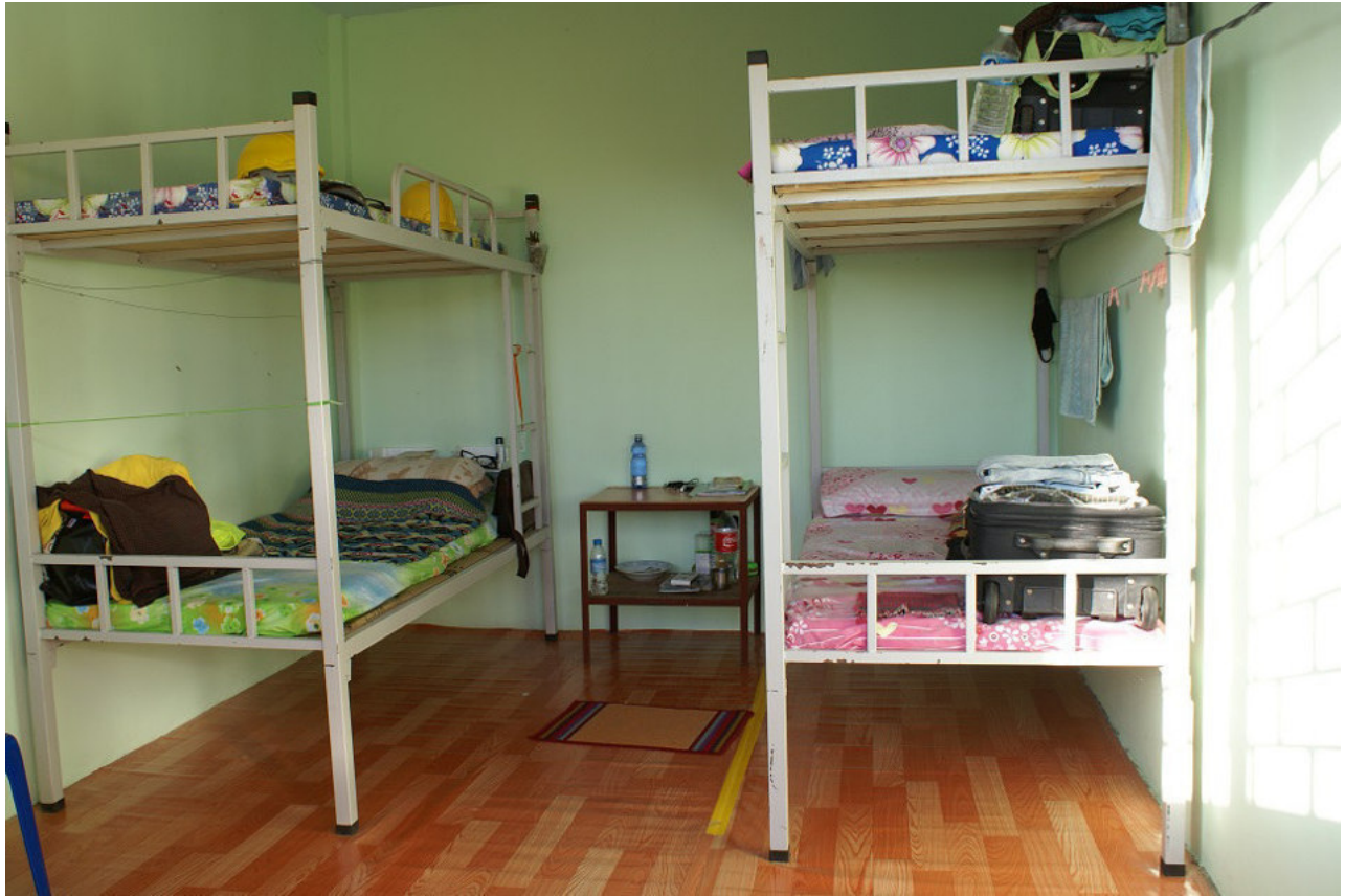
Photo No. 29. Womens skilled labor accommodations at the Jurong workers' accommodation camp