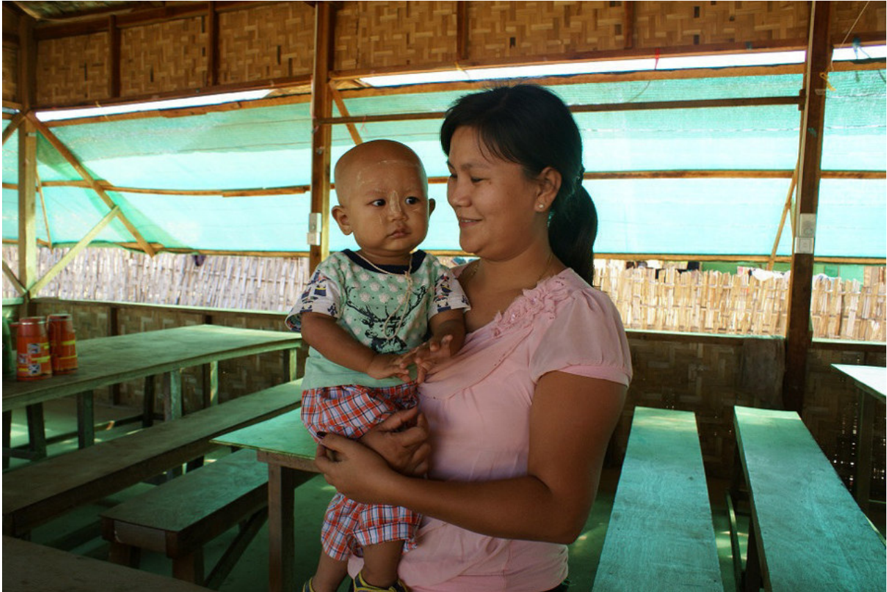
Photo No. 19. Worker's family that is living at the Min Dhama workers' accommodation camp