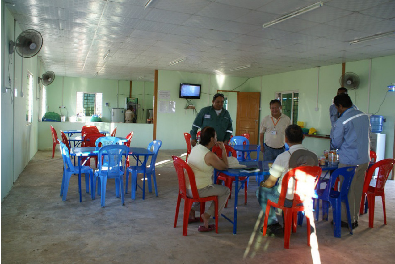
Photo No. 28. Dining area at the Jurong workers' accommodation camp