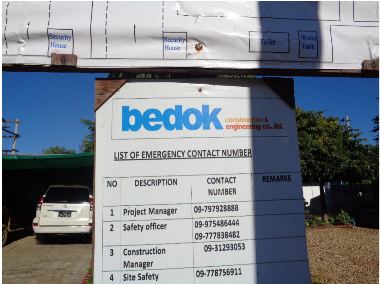
Photo No. 23. Emergency contact numbers at the Bedok workers' accommodation camp outside of the Project site.