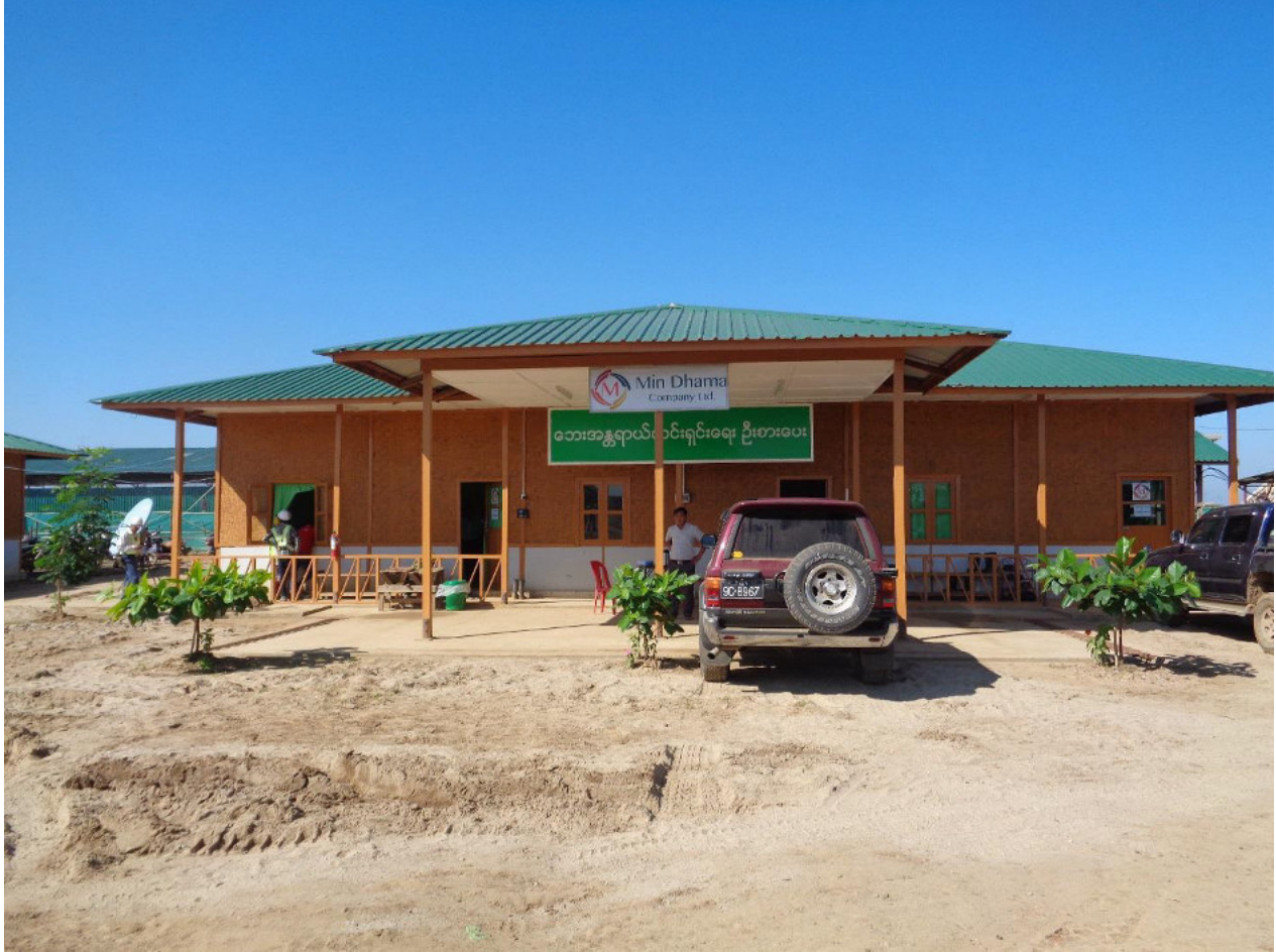
Photo No. 5. Contractor (Min Dhama) project office at the Project Construction site