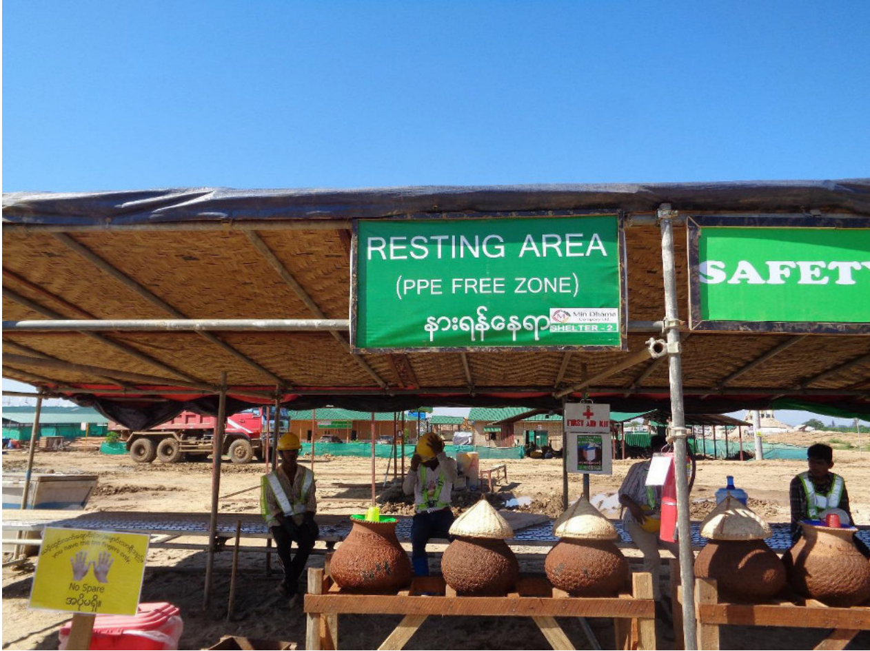
Photo No. 13. Workers rest area, Water drinking area, First Aid station at the Project construction site. The rest area is particularly beneficial to the workers during the summer months.