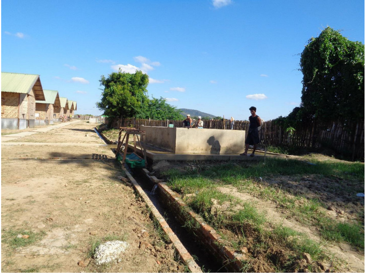
Photo No. 20. Water storage concrete tank for domestic use at the Min Dhama workers' accommodation camp