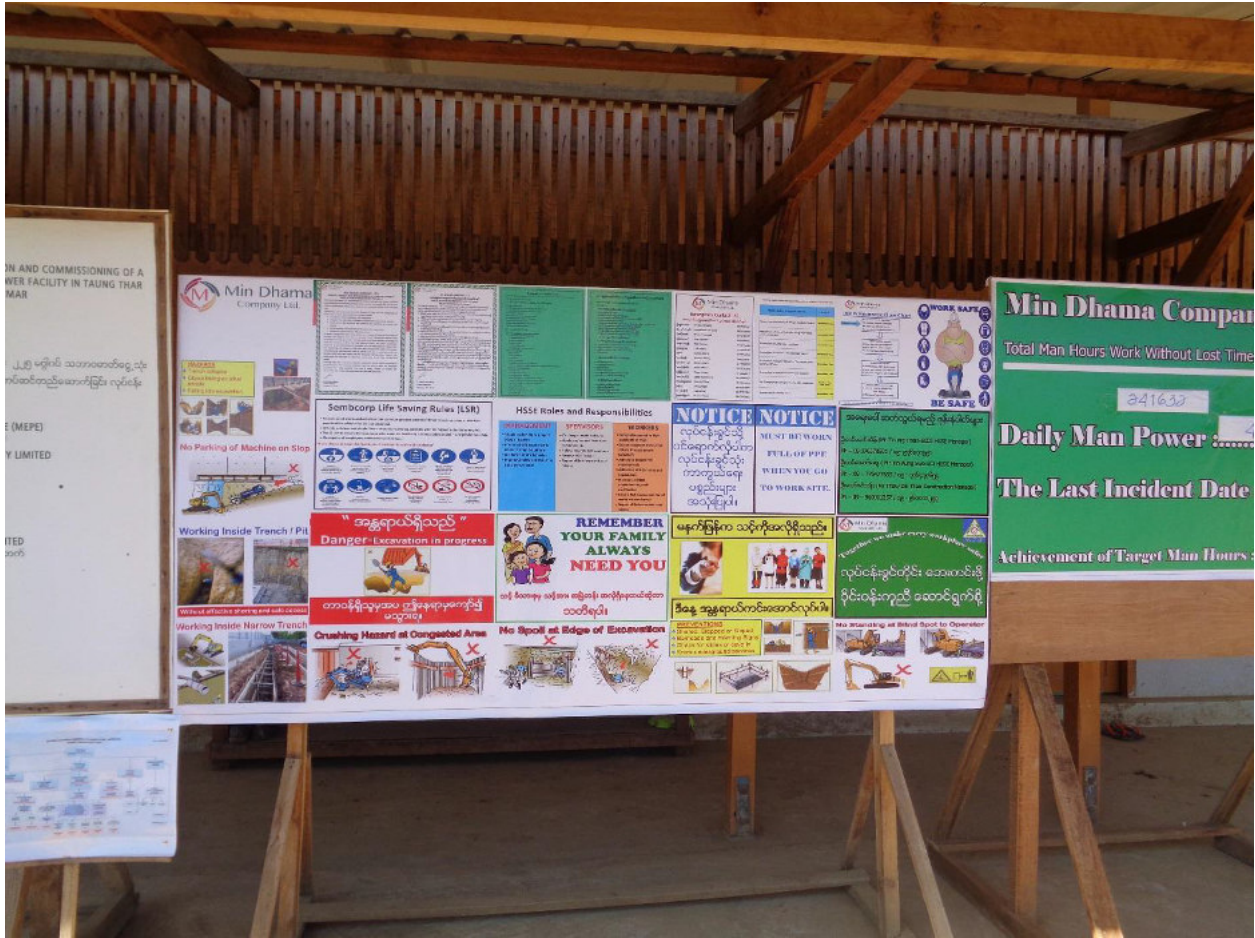
Photo No. 8. Safety reminders to workers outside the Min Dhama office at the Project site