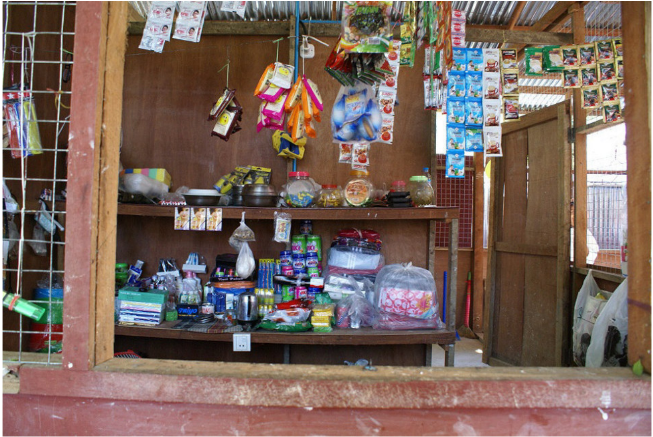
Photo No. 27. Shop at the Bedok workers' accommodation camp