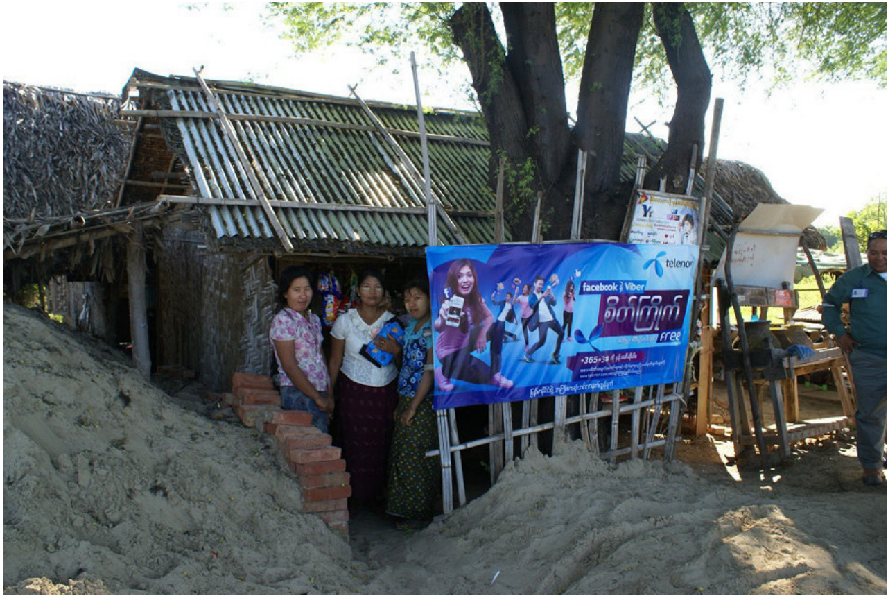
Photo No. 34. Young women we interviewed at a shop in Ayeywar along the water supply pipeline route