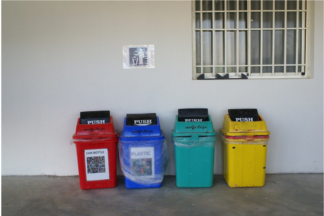
Photo No. 4. Waste Management at the Project site