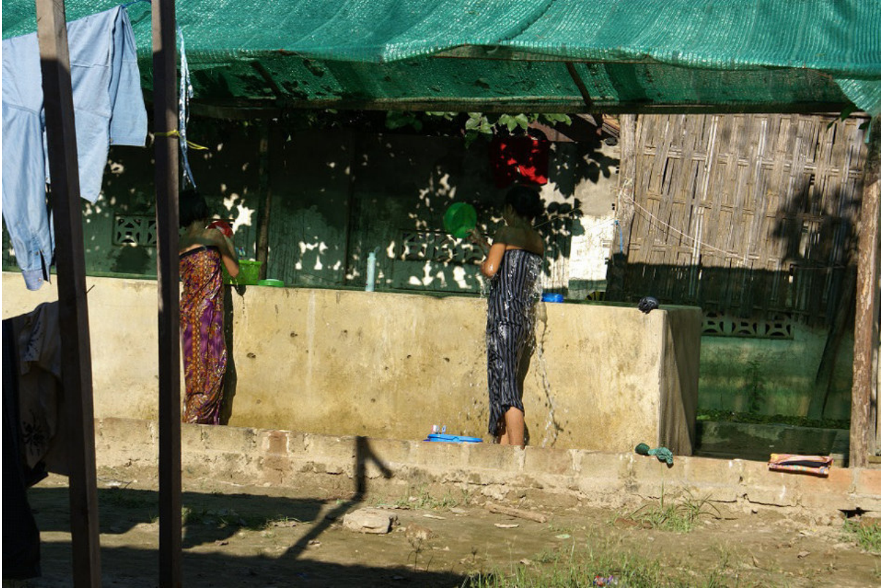
Photo No. 26. Outdoor bathing facility at the Bedok workers' accommodation camp