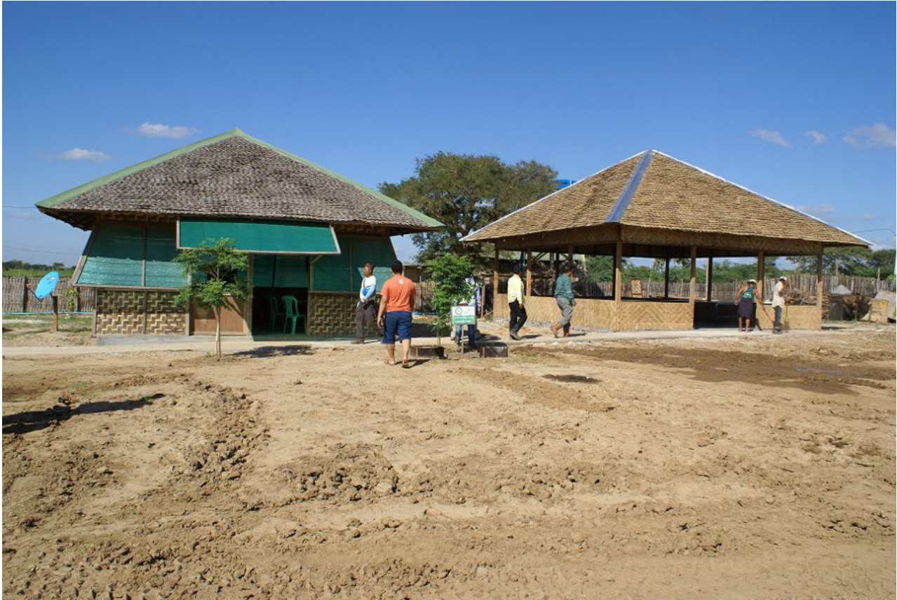
Photo No. 16. Recreation areas at the Min Dhama workers' accommodation camp