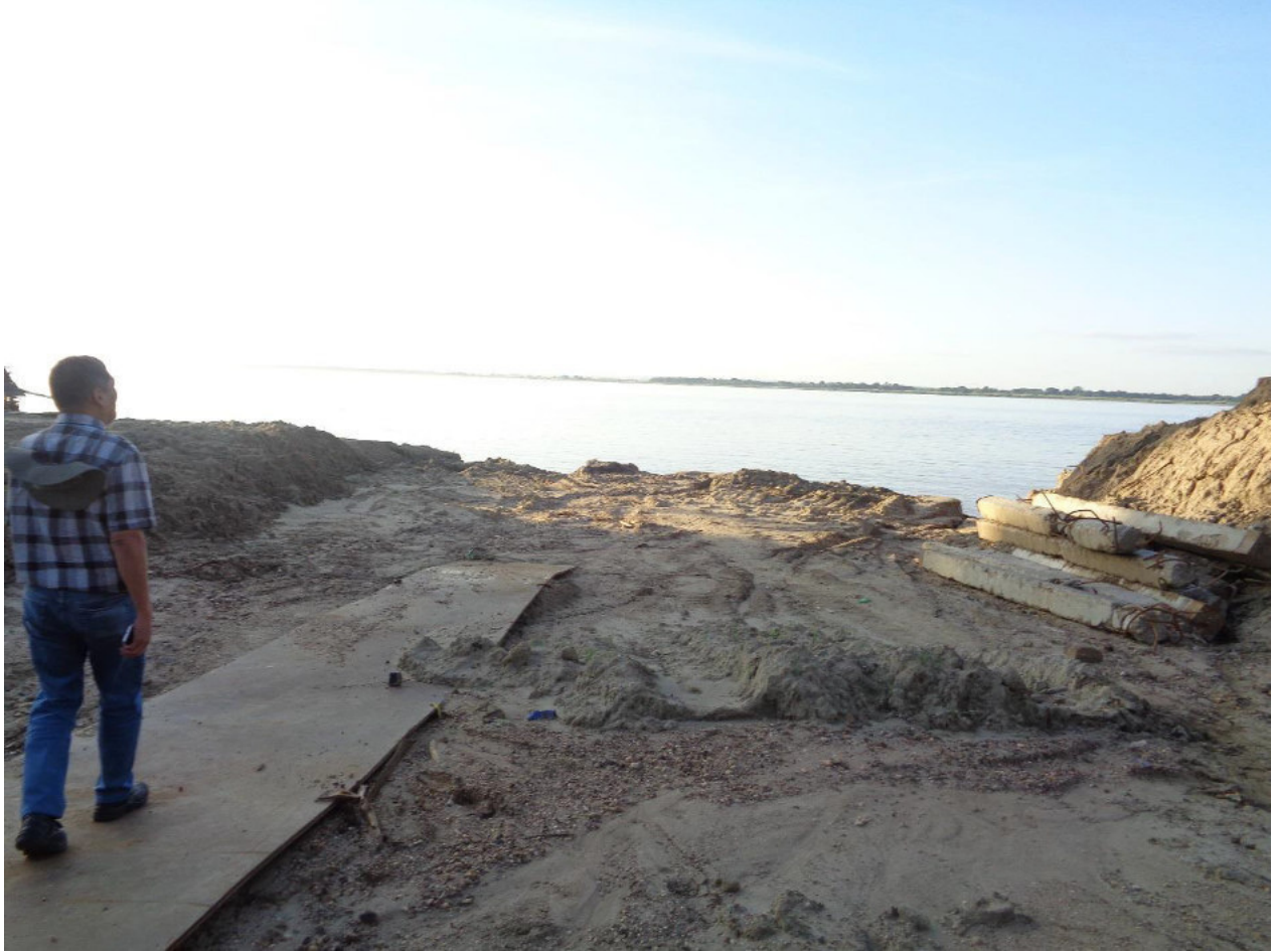
Photo No. 30. Private jetty at Nyaung Hla along the Ayeyarwaddy River. The jetty will be used to receive materials and supplies for the Project.