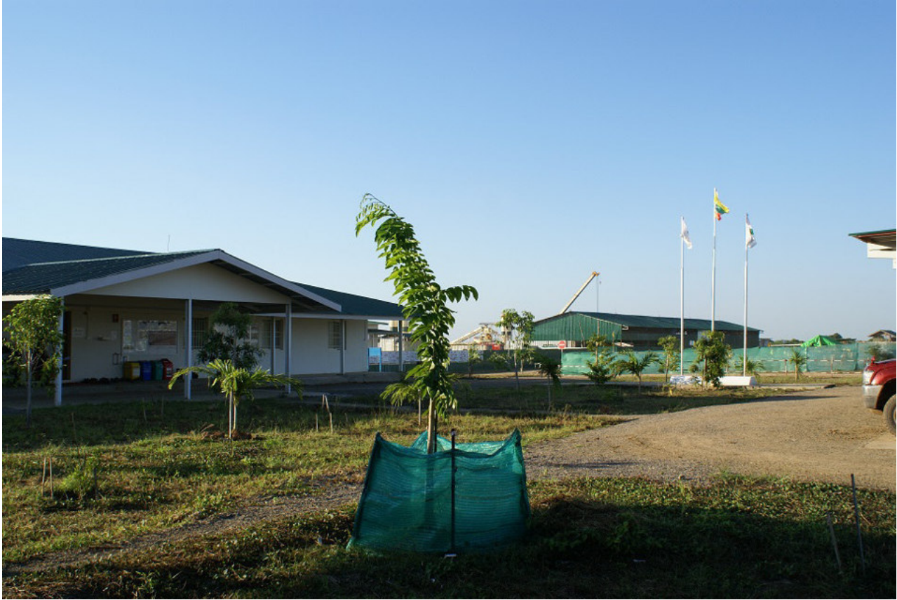
Photo No. 3. Offices and new trees planted at the Project site