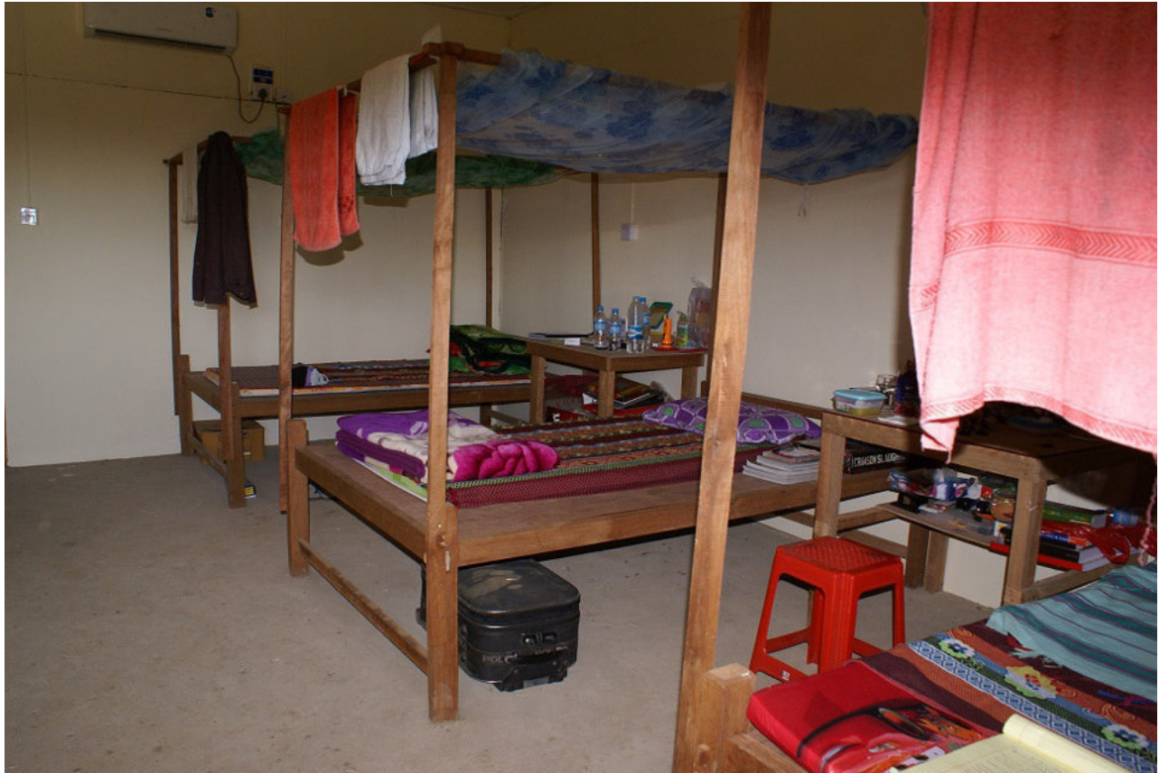
Photo No. 17. Womens skilled labor accommodations at the Min Dhama workers' accommodation camp