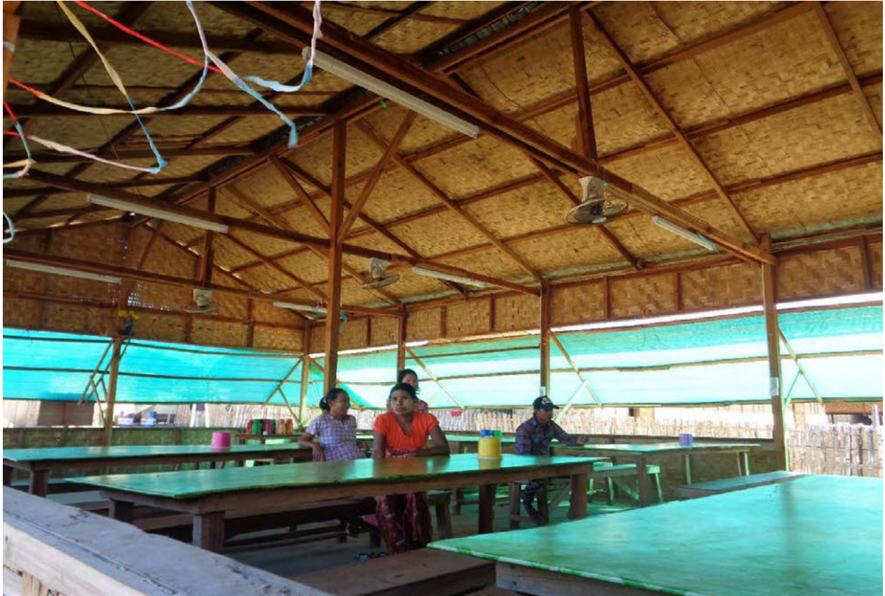
Photo No. 18. Dining area for Min Dhama workers at their workers' accommodation camp