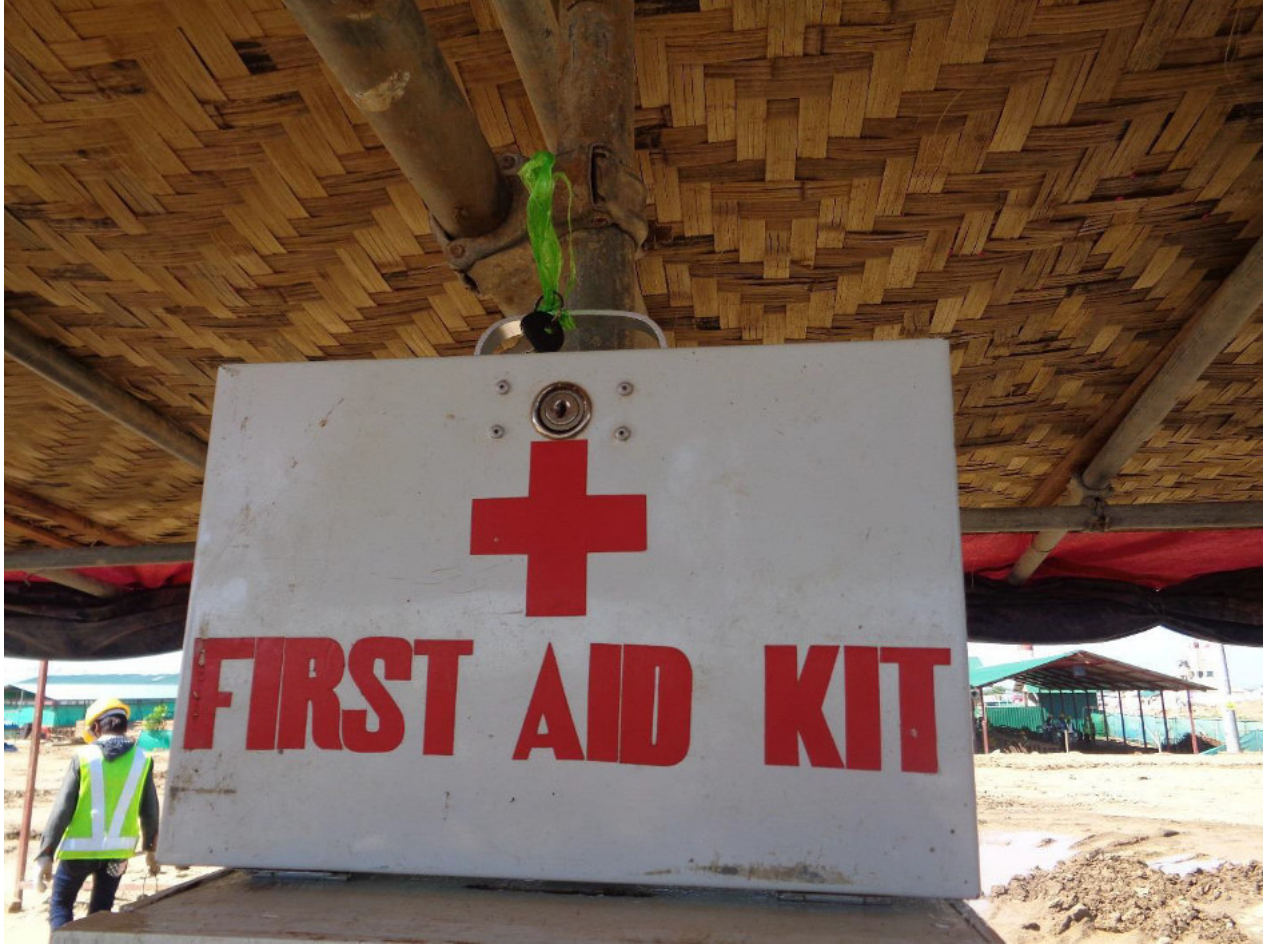
Photo No. 12. First Aid station at the Project construction site